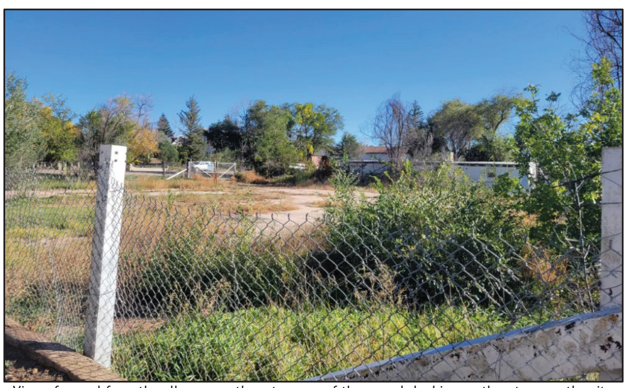
View of parcel from the alley on northwest corner of the parcel, looking southeast across the site.