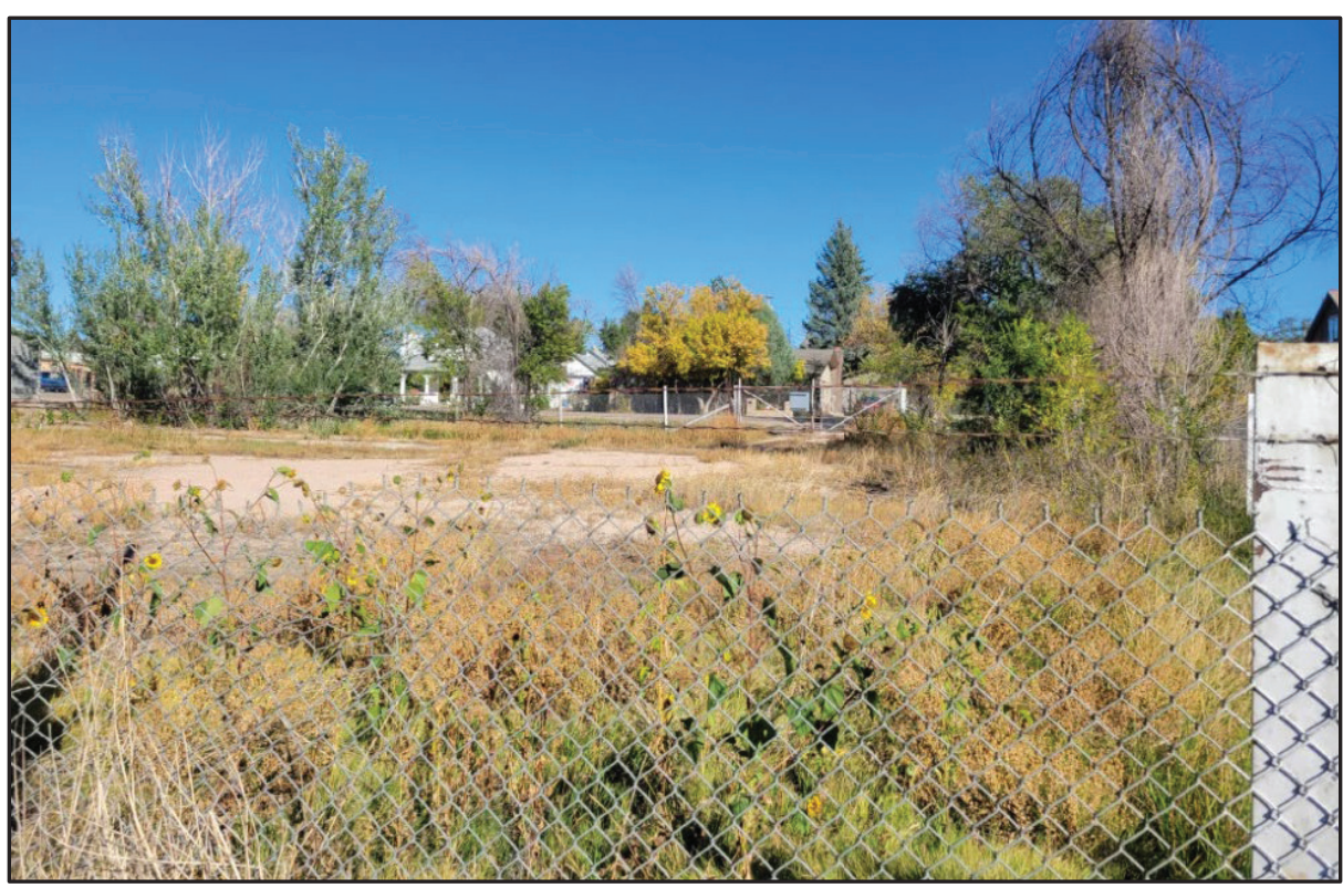
View of parcel from the alley on the southwest corner, looking northeast across the site.