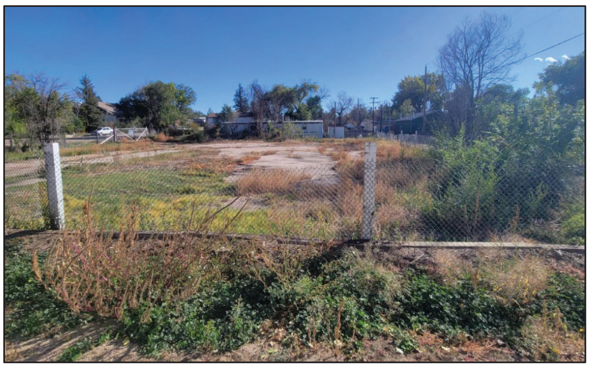
View of the Subject Disposal Parcel from the north. Looking south across the property.