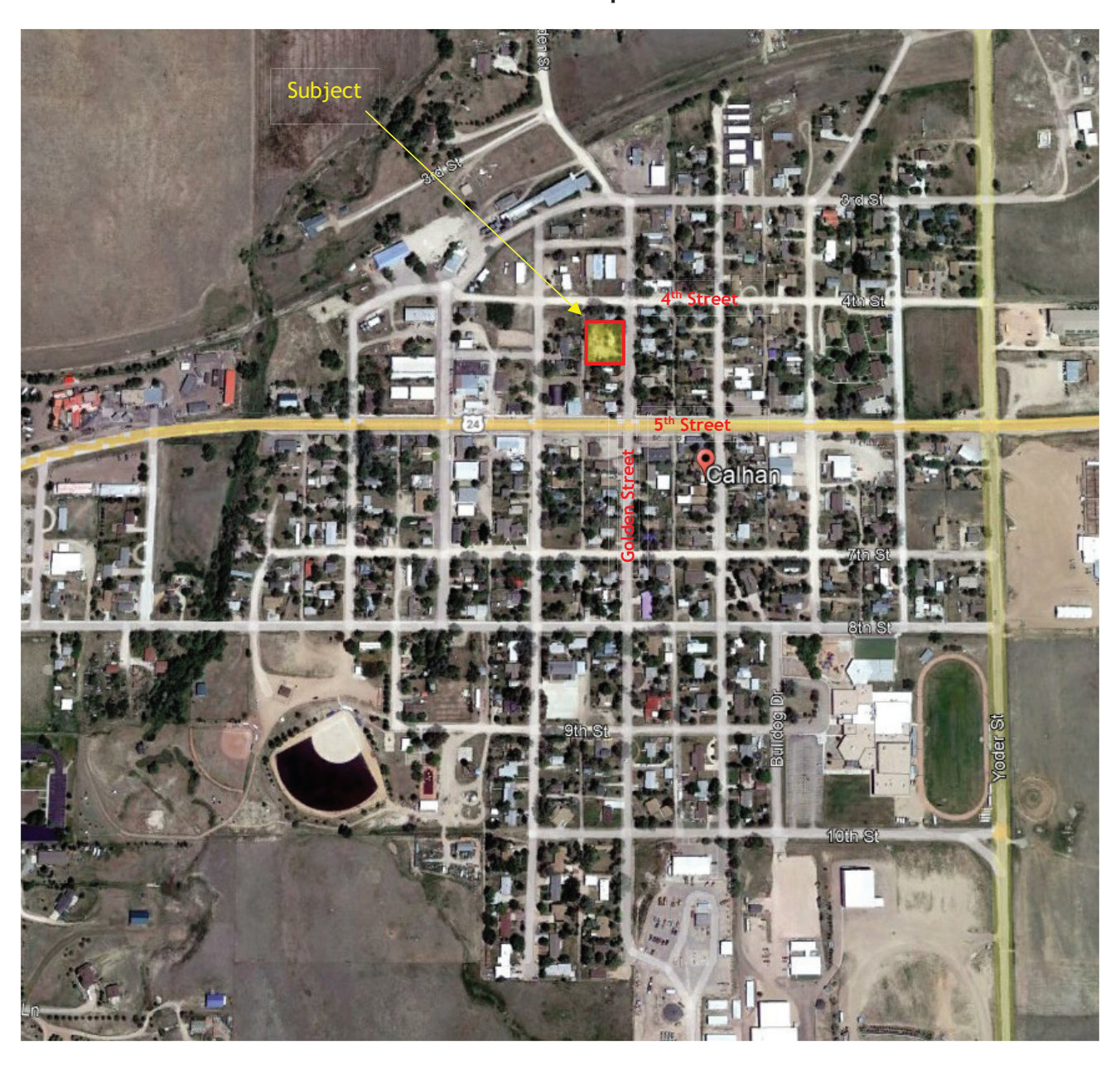
Aerial view of the Town of Calhan. The Subject Disposal Parcel is above (shaded in yellow, outlined in red) located north of 5<sup>th</sup> Street. Fifth Street is also known as US Highway 24.