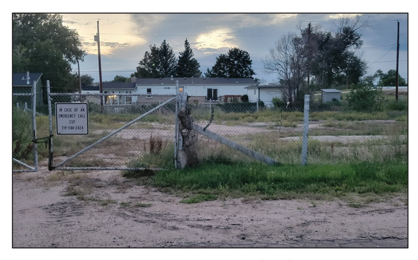
Subject view from the east on Golden Street, between \mathbf{4}^{th} and \mathbf{5}^{th} Street looking west.